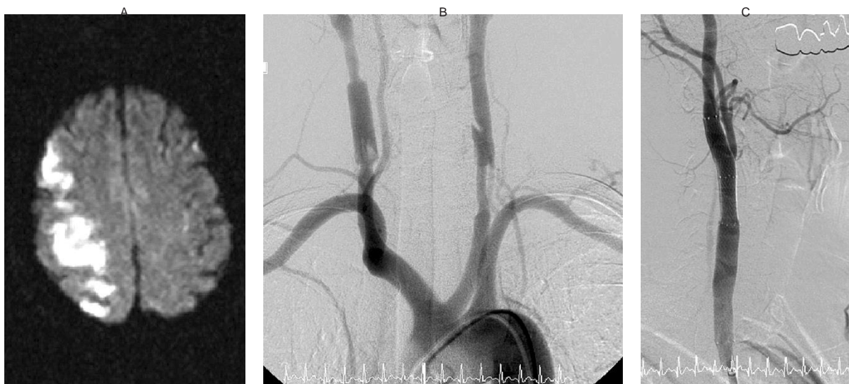
Figure 2 A) Diffusion-weighted magnetic resonance imaging (DWI) one day after the onset, showing new ischemic lesions in the right hemisphere. B) Aortogram one day after the trauma, showing bilateral common carotid dissection. Thrombus or intimal flap is recognized in the right common carotid artery (CCA). C) Right carotid angiograms after stent placement (right oblique view), revealing good patency of the right CCA.

Under local anesthesia, a 9F guiding catheter was advanced into the right common carotid artery (CCA). As the dissected lesion was too long to cover with a single stent, two stents were necessary to cover the entire lesion. A guard wire (PercuSurge system; Medtronic, Inc., Minneapolis, MN) was navigated into the right internal carotid artery beyond the dissection, and primary stenting was performed with an 8x 40 mm SMART stent (Cordis Endovascular, Miami Lakes, FL) for the distal part of dissection under distal protection. Then, a 9x 60 mm SMART stent was deployed in the proximal part in overlapped