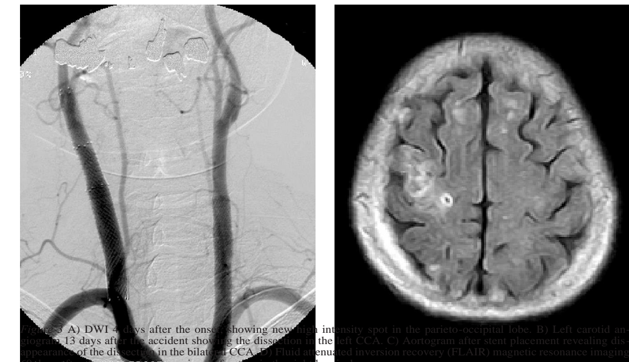
Figures 3 A) DWI 4 days after the onset, showing new high intensity spot in the parieto-occipital lobe. B) Left carotid angiogram, 13 days after the accident showing the dissection in the left CCA. C) Aortogram after stent placement revealing disappearance of the dissection in the bilateral CCA. D) Fluid attenuated inversion recovery (FLAIR) magnetic resonance imaging 60 days after the onset, showing minor infarction in the right hemisphere.